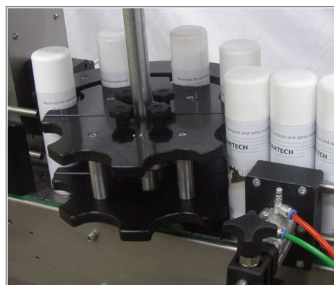
Rotational mechanism is a checkweigher DWR/H series

*- Profibus module available on client's request (option)